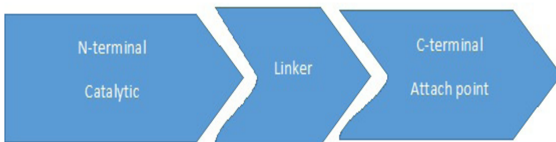
Fig. 1. Structure of phage lysins. C-terminal attaches to the cell wall carbohydrate and N-terminal causes lytic activity.

Narrow host range is the most basic problem in phage therapy [14], to solved this problem can used mix phage so called cocktail [14] that is more effective than one phage. This event because of synergism effect between all phages that are inside of cocktail [15].